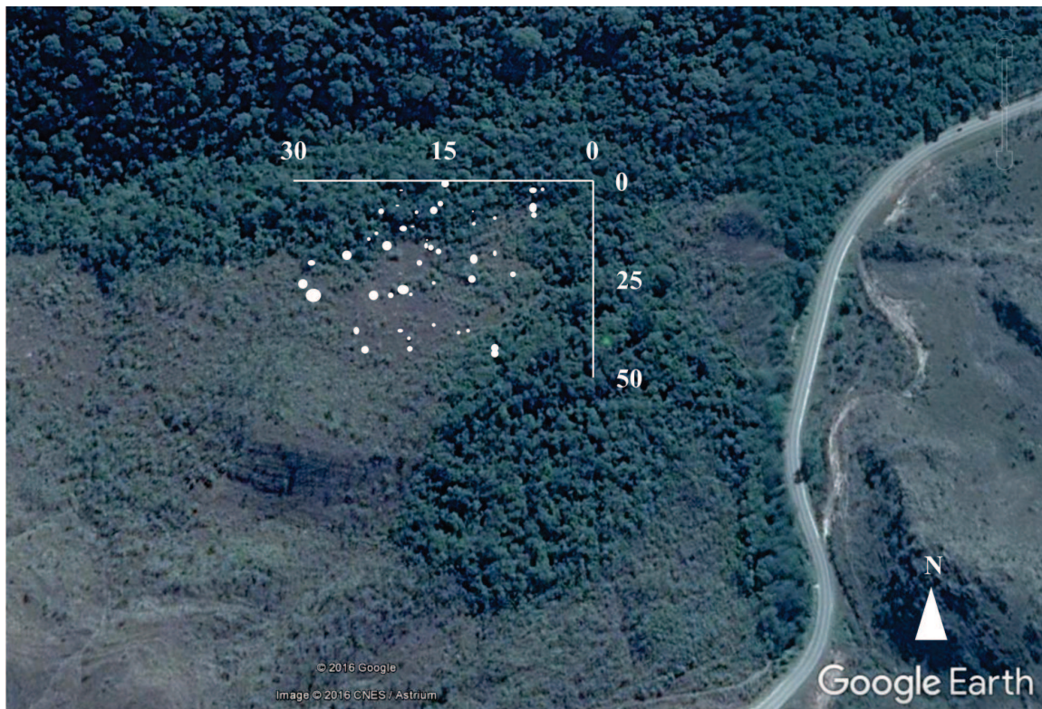
Figure 3: Bubble graph indicating the total gall density ( \ln + 1 transformed) in individuals of Heteropterys byrsonimifolia in a 1,500 m 2 ecotone between a semideciduous seasonal forest and savannah in Minas Gerais, Brazil. (Axes are presented in meters; larger bubbles represent higher gall density).

The significantly higher gall density in the upper stratum compared to the lower stratum may indicate that greater exposure of an individual affects gall density. Therefore, the analyses performed on the total gall density of individuals of H. byrsonimifolia were also performed by stratum (upper, intermediate and lower). However, the patterns were unclear by stratum. When considering the entire individual tree, the density of galls was significantly correlated with total height, crown depth and crown slenderness. However, the per stratum gall density did not reflect or weakly reflected the attributes used to illustrate the structural complexity of H. byrsonimifolia