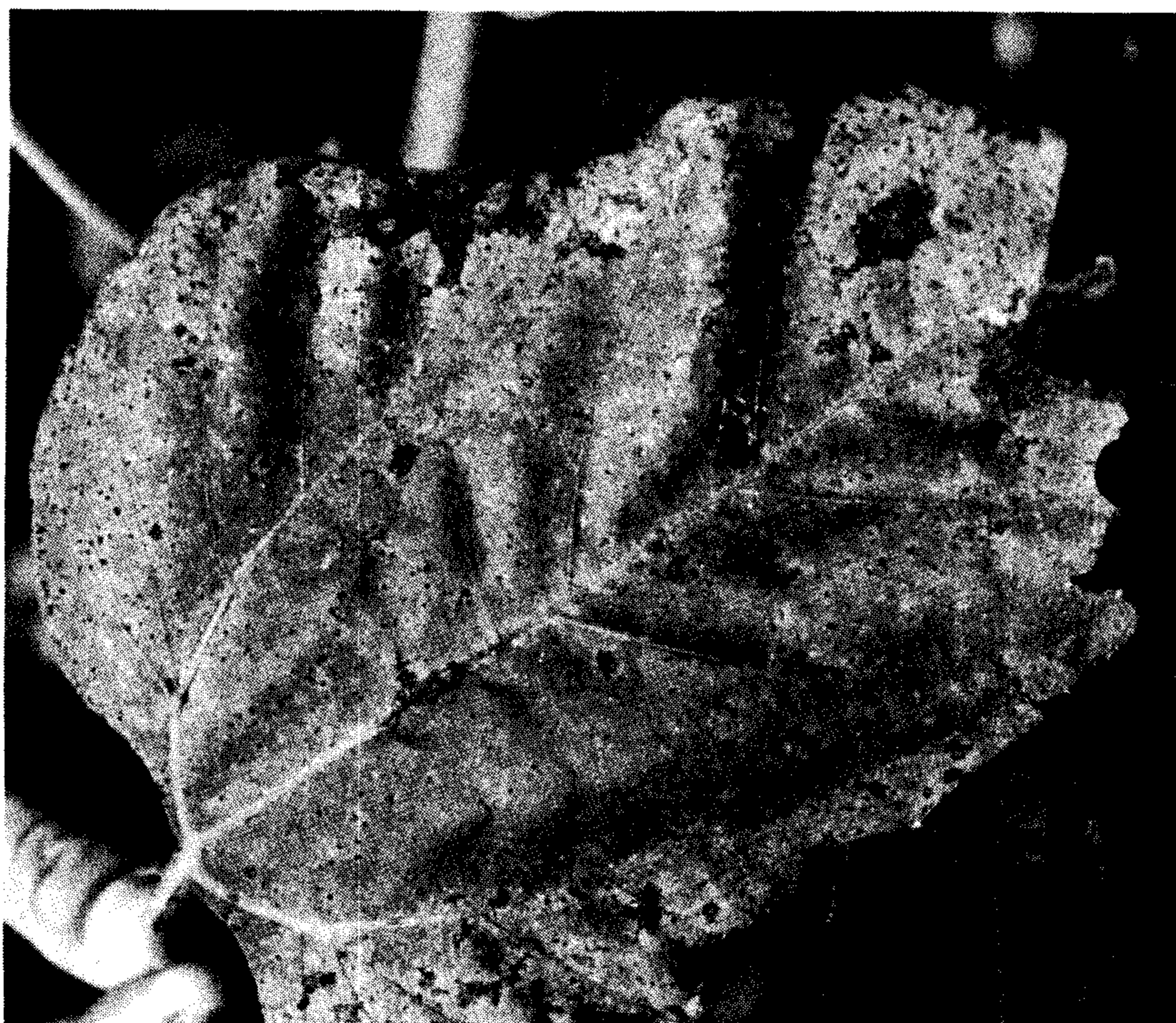
FIGURE 1 – Typical symptoms of the bacterial blight of sunflower under field conditions.

Typical symptoms (Figure 1) consisted of necrotic lesions, dark to black, usually surrounded by chlorotic haloes, predominantly in leaves but